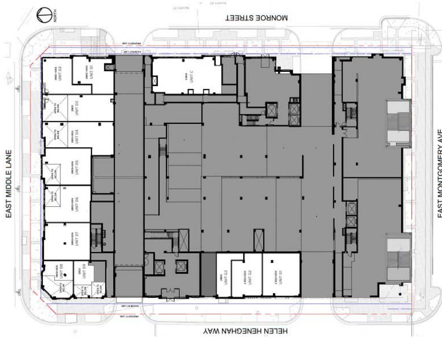
A6 Retail Conversion - Overall View Mezzanine L2 1/8" = 1'-0"

Floor Plans – Ground and Mezzanine Levels White – converted retail to residential space Gray – no change to existing building